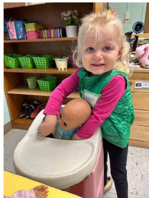
Turning 3 friends